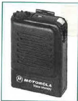
Operating Instructions 68P81011B80-A

Congratulations on your choice of the Motorola KeyNote Two-Tone Sequential Coding Tone and Voice Pager with Voice Memory. This state-of-the-art receiver has been designed for ease of use, as well as high performance and reliability that pager users have come to expect from Motorola. The Voice Memory feature is an advanced technological breakthrough in radio paging equipment which offers the advantage of storing a voice message to be replayed at your convenience. Setting the pace with its unique, compact design and conformance to the most stringent quality standards, KeyNote Voice Memory is the ultimate tone-and-voice pager.